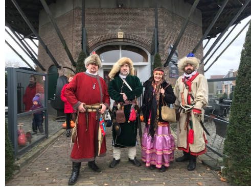
Bashkir delegation in front of windmill in Wijhe, 26 November 2021