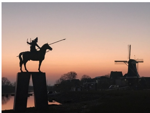
Sunset at the IJssel River with Bashkir Horseman and Mölle van Bats windmill, Veessen, 5 March 2022

https://geelvinck.nl/basjkierse-delegatie-bezoekt-veessen-en-wijhe-26-november/