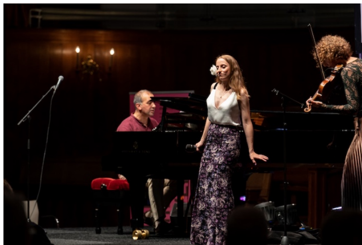
UITfestival Nieuwe Kerk 5-9-2020