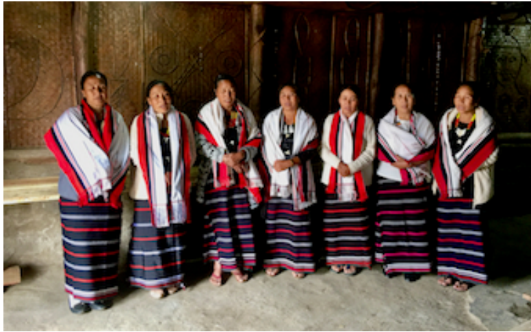
Women singers of the group Kezuyima (Benreu, Peren district, Nagaland)